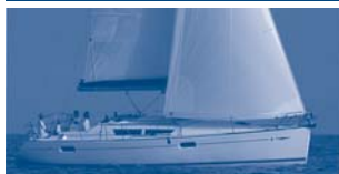
Sun Odyssey 39i