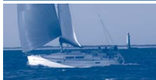
Sun Odyssey 39i Performance