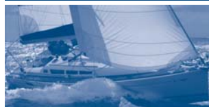
Sun Odyssey 42i