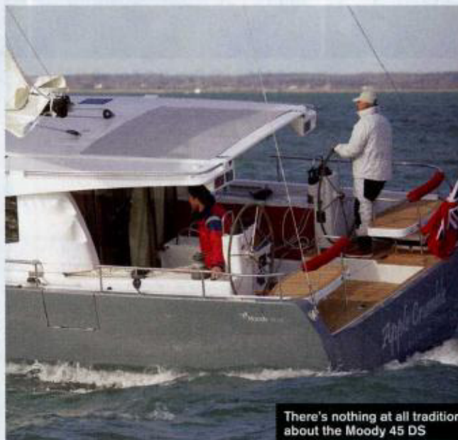
There's nothing at all traditional about the Moody 45 DS

→ Moody: www.moodyyachts.com Lagoon: www.cata-lagoon.com