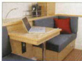
The saloon sitting area can be configured in several ways, including with this small table

The Hanse 430 has a distinctly modern interior, especially with the optional cherry finish. The standard mahogany interior with white bulkheads does give a nod to the past, but nobody will mistake the accommodation space for a Herreshoff design. Cabinetry is flush-surfaced and precisely fitted, and the grabrails outboard of the seats blend so neatly into the decor that the skipper may need to point them out to guests. While this boat is unquestionably strong and seaworthy enough to cross oceans, the interior makes it clear that its main mission is stylish cruising. Note that voyaging will call for leechcloths on the bunks, higher countertop fiddles, and positive latches on the cabin sole. Hanse lets buyers choose among berth configurations (standard V-berth or offset Pullman berth, with or without a pilotberth) for both the forward and aft cabins; another choice is between one or two cabins aft.