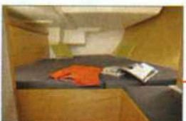
Dual aft cabins with large double berths are the most common guest-cabin layout