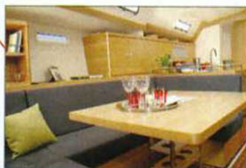
The elegantly modern saloon styling makes it a pleasant space to hang out