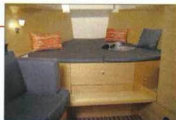
The forward cabin with ensuite head is worthy of being called the "owner's cabin"