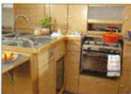
The galley layout, like the rest of the boat, is both stylish and functional