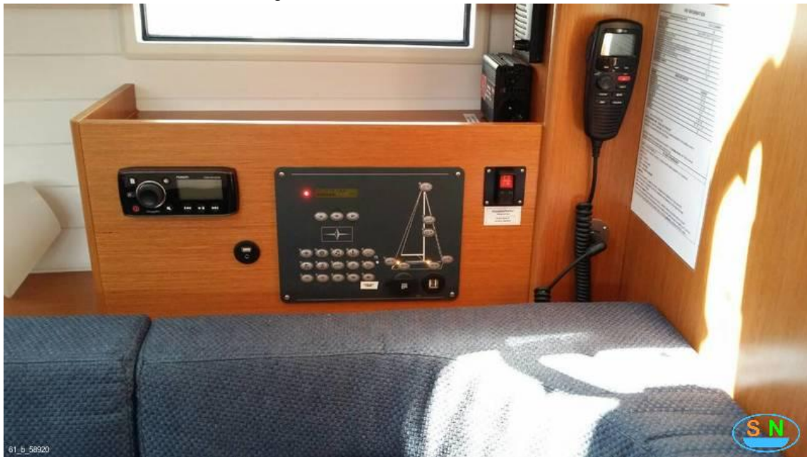
Cabin / Bavaria CRUISER 46 - 2017