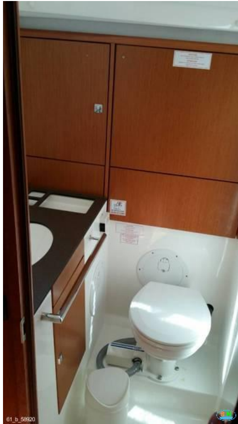
Bath / Toilet / Bavaria CRUISER 46 - 2017