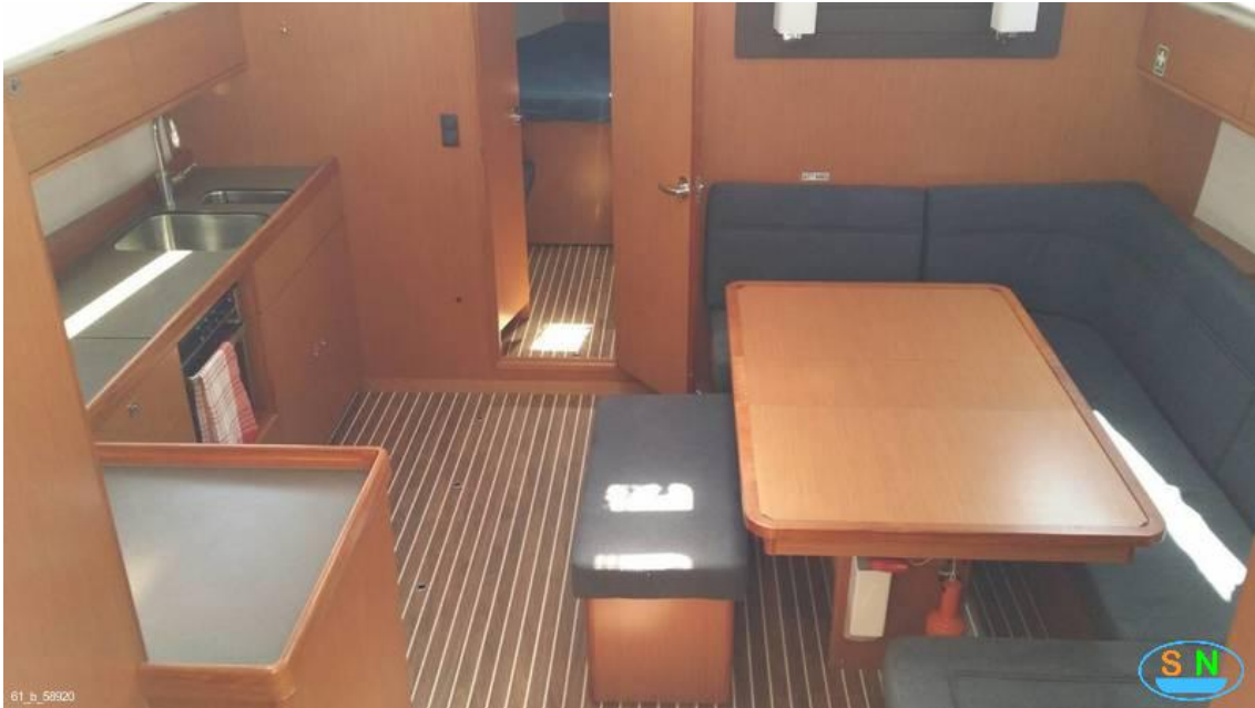
Galley / Bavaria CRUISER 46 - 2017