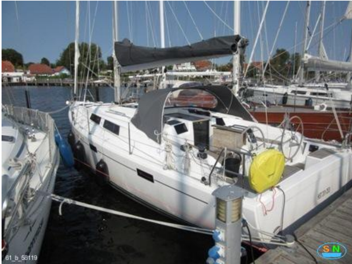
Cockpit / Hanse 415 - 2016