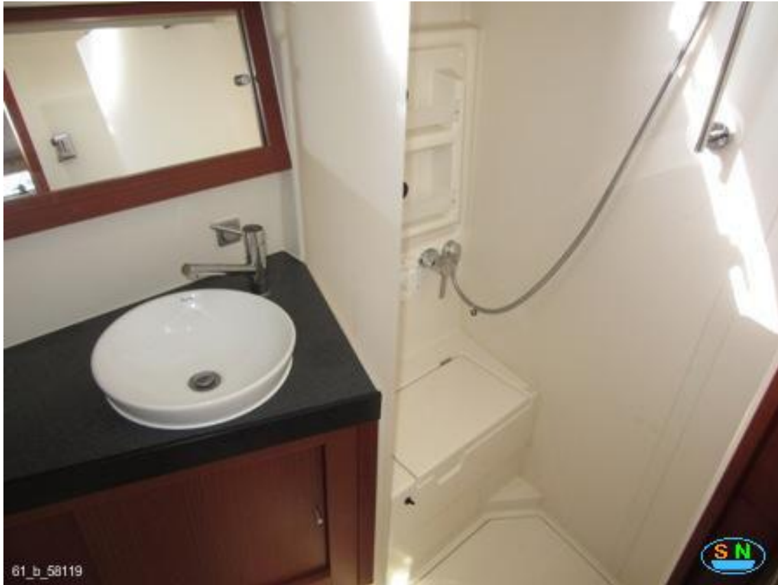
Layout / Hanse 415 - 2016