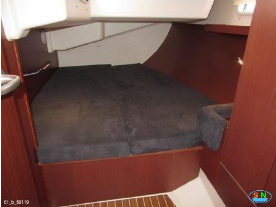
Cabin / Hanse 415 - 2016