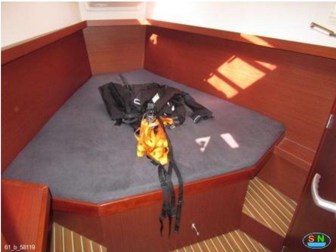
Cabin / Hanse 415 - 2016