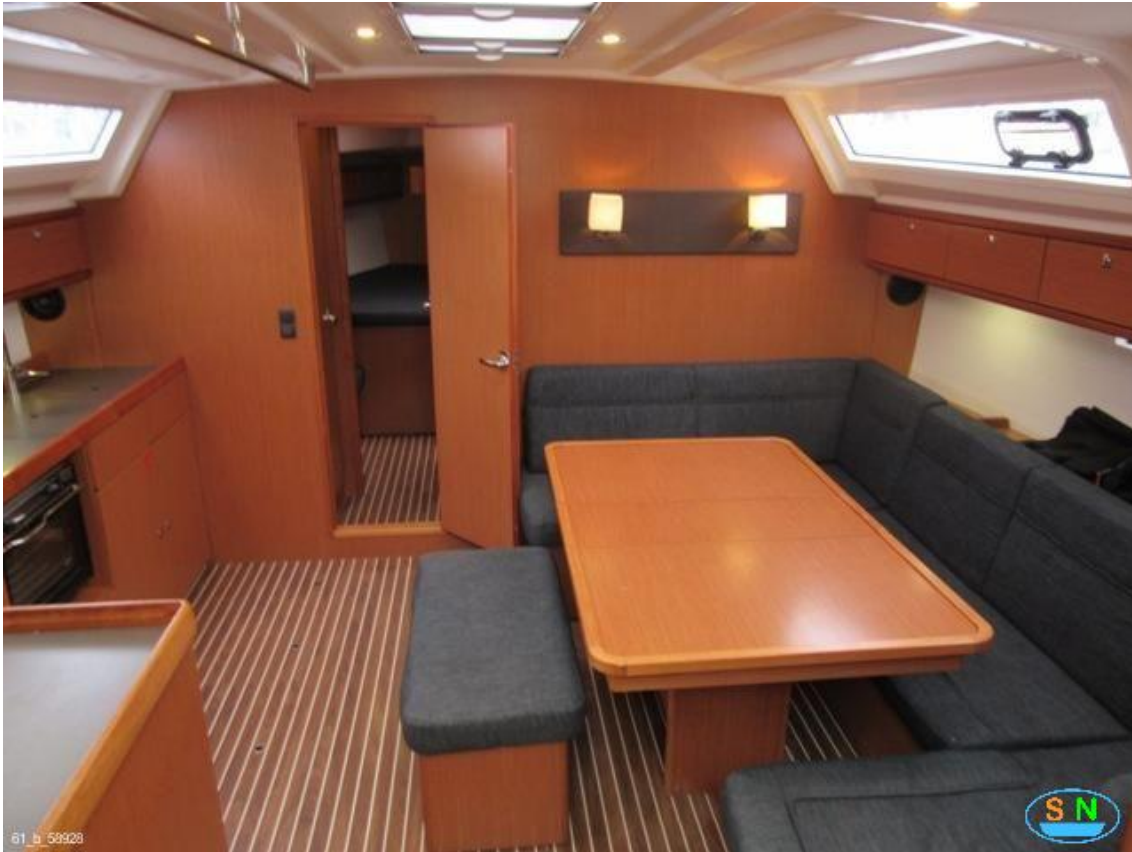
Salon / Bavaria Cruiser 46 - 2014