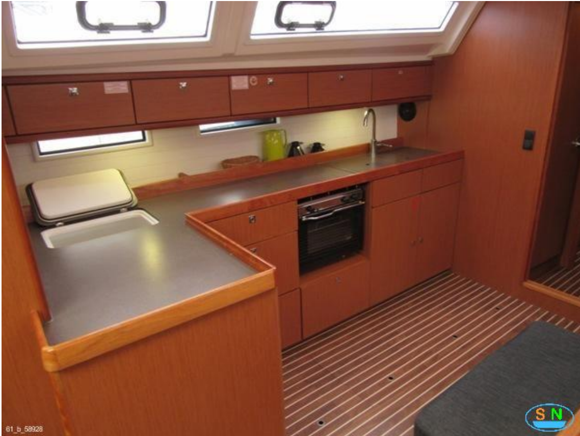
Cabin / Bavaria Cruiser 46 - 2014