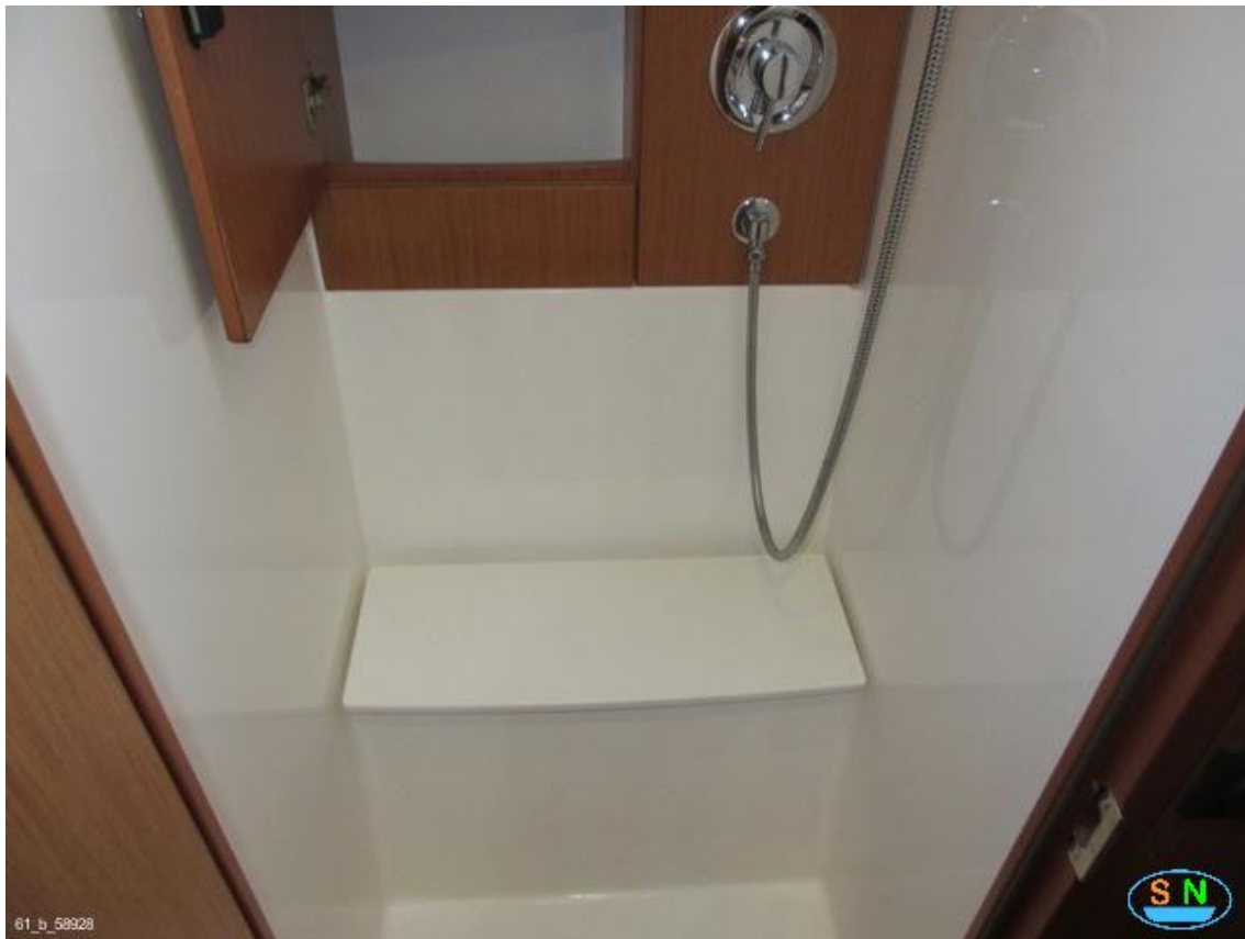
Layout / Bavaria Cruiser 46 - 2014